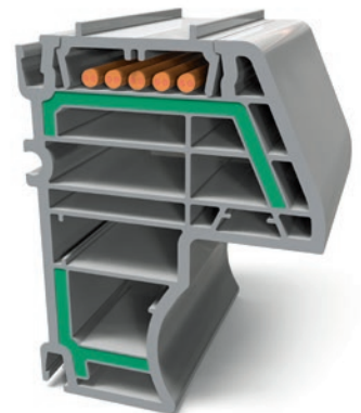
Profile from the "white goods" sector