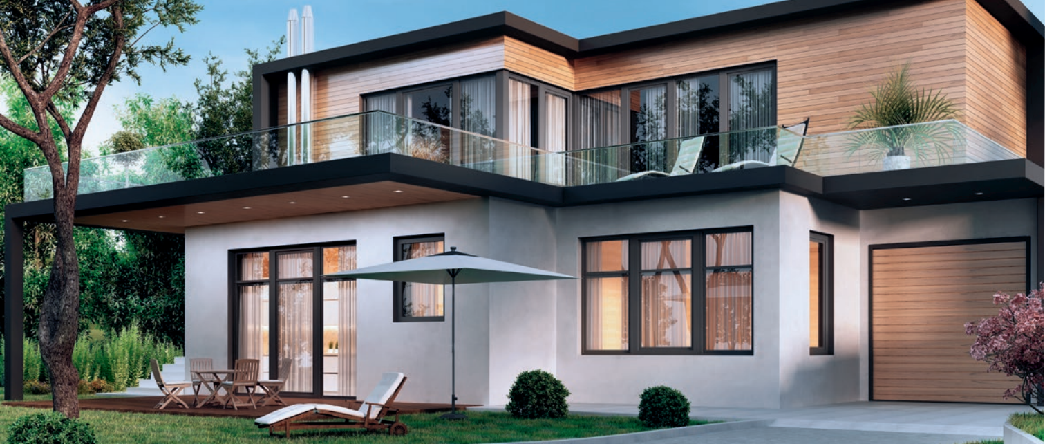
Ultradur for window profiles: Lighter than steel and yet high-strength