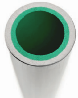
Technical profile with Ultradur