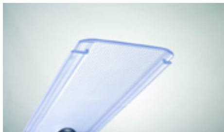
Pexco used aircraft-compliant materials for its air transfer profile (ULTEM resin) and its lighting lens (LEXAN resin).