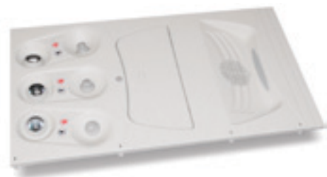
Goodrich Hella Aerospace Lighting Systems passenger service unit using ULTEM resin