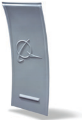
Thermoformed by Texstars Inc., ULTEM 1668A sheet forms the entire cockpit of C17 jetliners. The material was chosen for its flame, smoke and toxicity performance and for its exceptional impact strength.