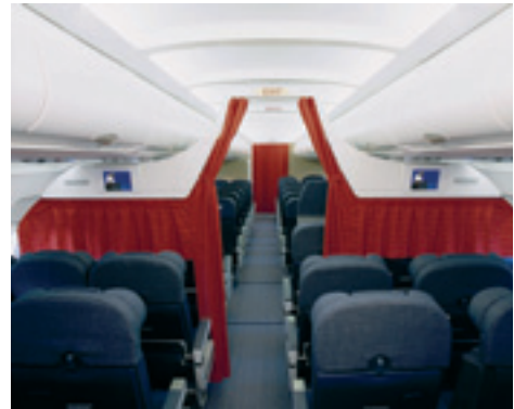
SABIC provided parts made from ULTEM 1668A sheet for the development of Adder cabin dividers.

By incorporating ULTEM 1668A sheet, designers can achieve halogen-free compliance along with superior stiffness and the ability to safely combine with leather-based decorative skins as well as a variety of adhesive systems used for bonding to plastic substrate. Application opportunities for this advanced lightweight material include first-class and business-class seats and cockpit panels.