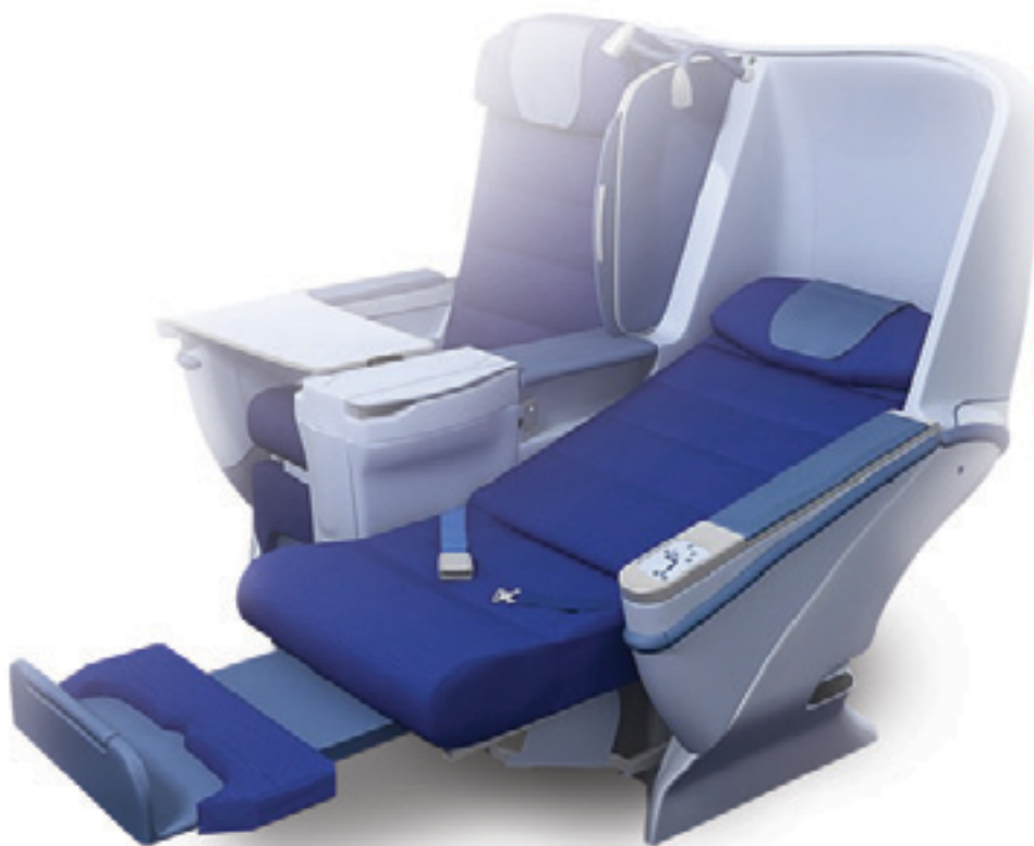
EADS Sogerma's first and business class seats use SABIC's LEXAN sheet.

Versatile LEXAN CFR5630 resin is suitable for small opaque parts such as window and seating components.