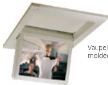
Vaupell aircraft video display molded from ULTEM 9075 resin