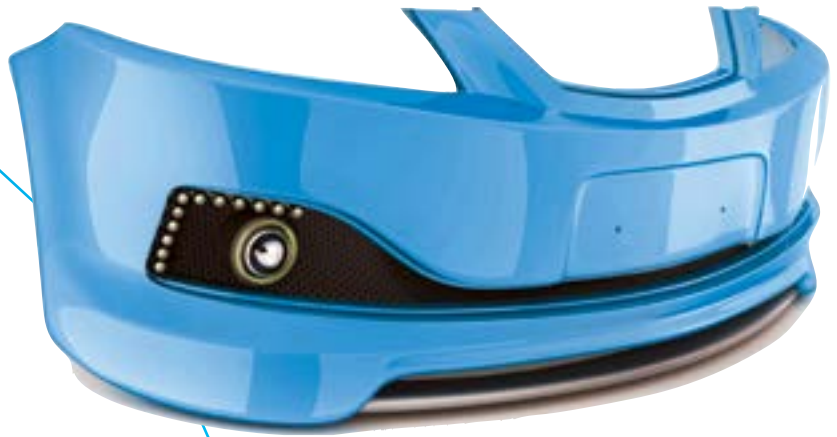
Compounding - Typical Properties